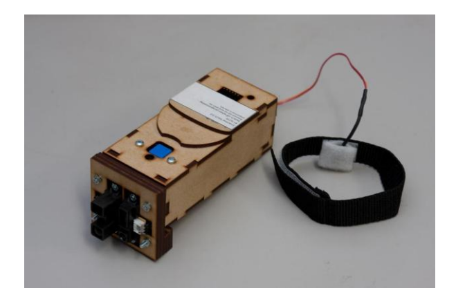
Figure 1. The Enactive Torch. The handheld device has a configurable front-mounted distance sensor. A vibro-tactile actuator is worn on the wrist using the pictured Velcro strap.

The Enactive Torch (ET) (see Figure 1) is an enactive interface specifically designed for the