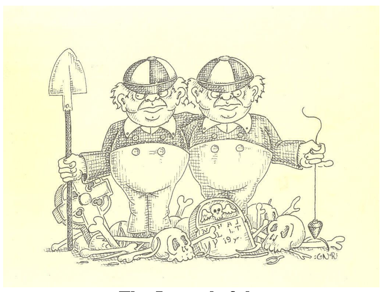
The Journal of the Archchæological Society University College Dublin