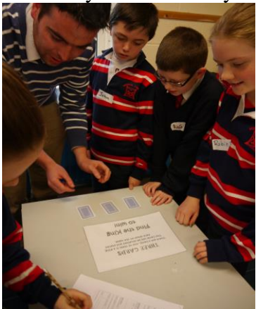
Figure 3: Find the king to win

Students calculate the probability of winning (1 in 3), play this game 3 times and record how many times that they find the King.