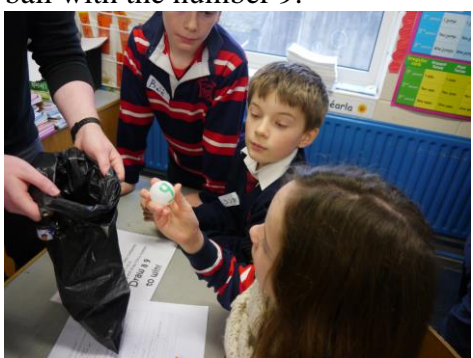
Figure 5: Lottery: Get a 9 to win

A bag is filled with 9 numbered ping-pong balls. Students must draw a 9 to win (Figure 5). They record the chances of winning (1 in 9) before making 9 draws. They then record the number of times they drew a ping pong ball with the number 9.